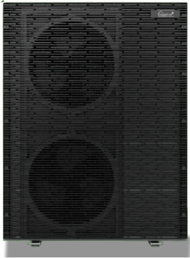
SHP290 12 kW